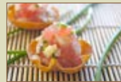
Tuna Tartar 13.95

Layered Sushi Rice, avocado, seaweed salad and Tuna Tartar (Chopped tuna mixed with spicy kimji sauce and ponzu sauce) garnished with tobiko, sesame seed, spicy mayo sauce, eel sauce, and wasabi sauce.