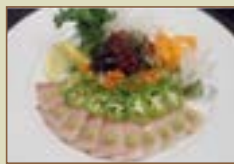
Hamachi Jalapen 17.95

Yellow tail, thinly sliced with jalapeno served with ponzu sauce