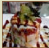
Tuna Tower 17.95

Yellow tail, thinly sliced with jalapeno served with ponzu sauce